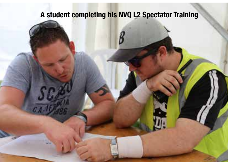
A student completing his NVQ L2 Spectator Training