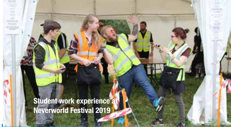
Student work experience at Neverworld Festival 2019

Some of our most exciting partners are music festivals! These allow our students the opportunity to gain genuine work experience as stewards, sound engineers, health and safety officers, artist liaison and bookers, journalists, photographers and artists themselves. Students are also able to gain an additional NVQ L2 Spectator Safety Award that can lead to paid roles within the industry.