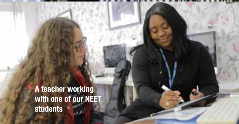
A teacher working with one of our NEET students

“We’re not interested in the past, only the future for these young people, that’s where it gets exciting for them.”