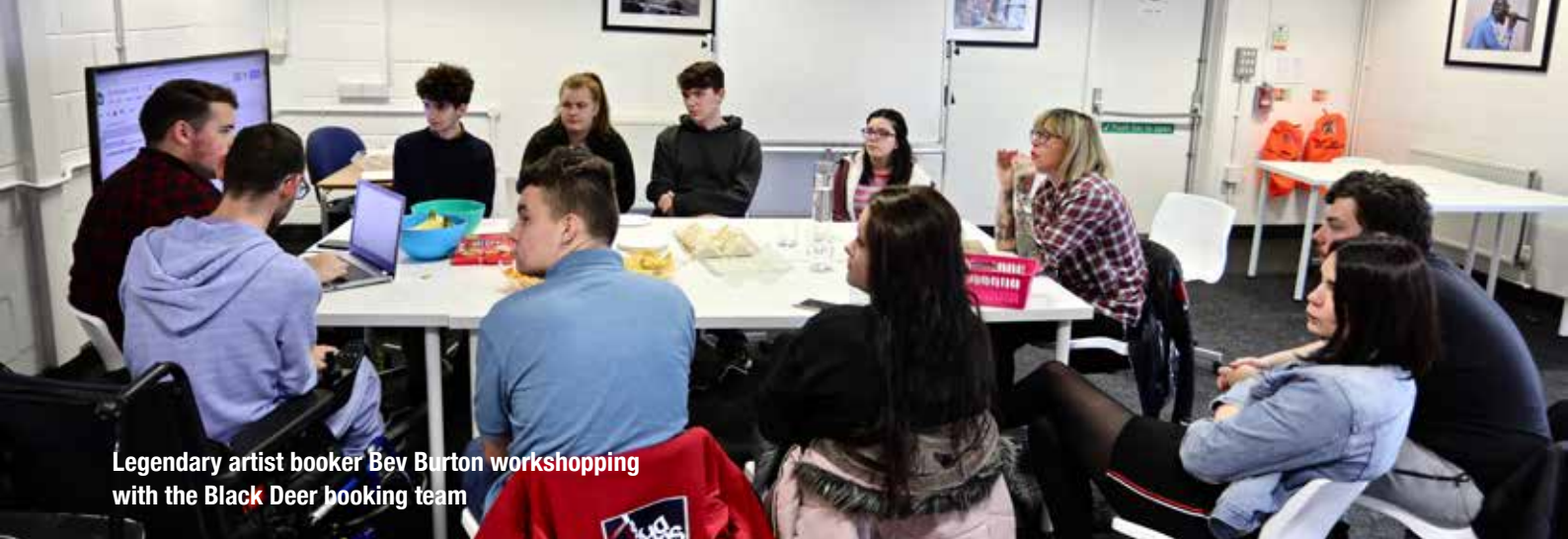
Legendary artist booker Bev Burton workshopping with the Black Deer booking team