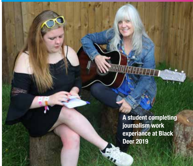
A student completing journalism work experience at Black Deer 2019

Gill Tee and Debs Shilling - Black Deer Co-founders