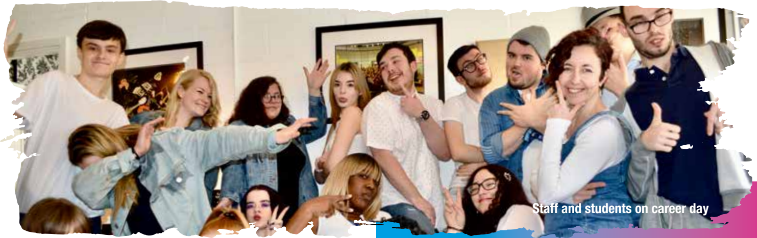
Staff and students on career day